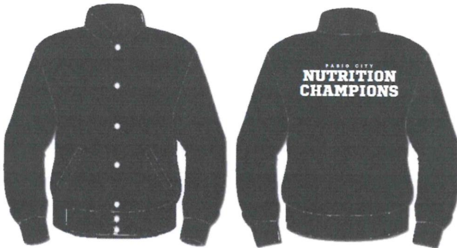
MEN VARSITY JACKET MEASUREMENTS IN INCHES(USA/CANADA)

no. sizes: mens size: LARGE = 8; X- Large = 10; 2XL = 10; 3XL=10